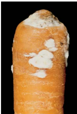
Cottony mycelial growth of Sclerotinia sclerotiorum on carrots.