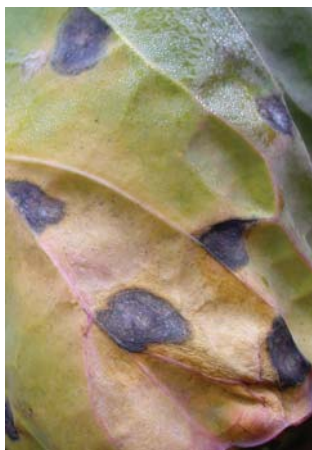
Ring spot caused by Mycosphaerella brassicicola .

No more than three applications of Nativo 75WG may be applied to a given area of land per calendar year.