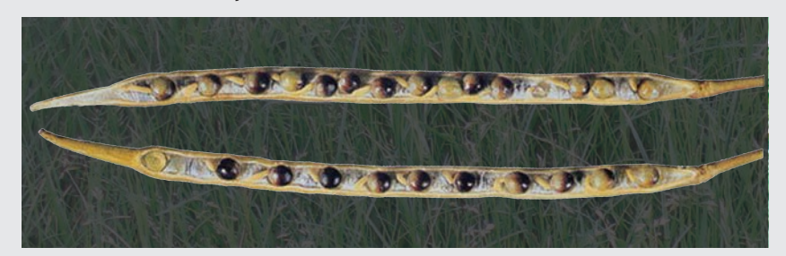
Check pods for timing

*If approximately half of the seeds are turning brown, the crop should be ready to spray in 3 days but repeat the procedure to check that the correct stage has been reached. Spraying too early will lead to poor desiccation.